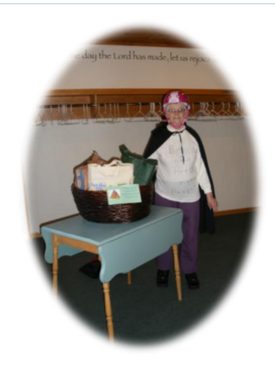
Our Hungry Hero in 2018